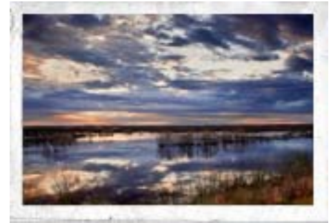
Creole Nature Trail

to your smartphone). There is no charge for the Ranger, but you need to leave a credit card until the Ranger is returned. You can pick the Ranger up the day before if you'd like to get an early morning start on Saturday or Sunday. The GPS Ranger is a self-guided audio/video tour of the entire trail. It knows where you are and tells you what you're about to see and where to turn if you want to explore other things. An awesome experience. The tour includes a ferry ride (runs 24/7 there is fee for West route but East route [to Lake Charles] is complimentary) and is extremely informative about the local history, economics, wildlife, etc. It is a great way to get to know the area you're visiting. Once finished with your tour, return the Ranger and pick up your credit card. Read more details online ( www.creolenaturetrail.org ).